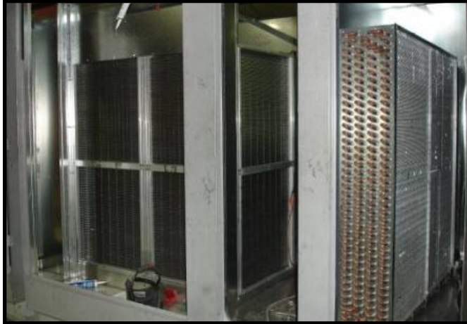
The heat exchanger (left) and cold water coil (right). The exchanger is flat, creating no turns within the unit.

This custom XVC unit was built so that the customer, a university laboratory complex, could provide their own exhaust air blower section. Unlike most XVC units, which have exhaust air inlets on the bottom and exhaust air outlet sections on top, exhaust air enters this unit through one of its sides and passes straight out the other. In this airstream, XeteX only provided the exchanger and dampers. On the supply side, however, XeteX built the unit with cold water and steam coils, final filters, dampers, actuators, an air foil plenum blower, and a humidifier section. When finished, this unit gave the lab operators complete control over temperature and humidity, year-round energy recovery, and a custom configuration that met their requirements.